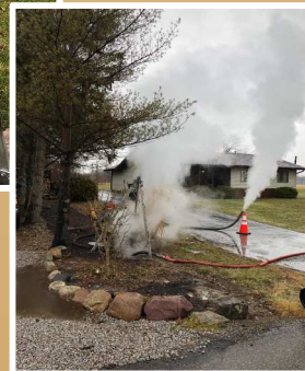
Sanitary Sewer Lining Process